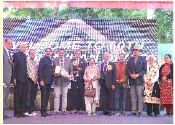
Sood Sabha Solan