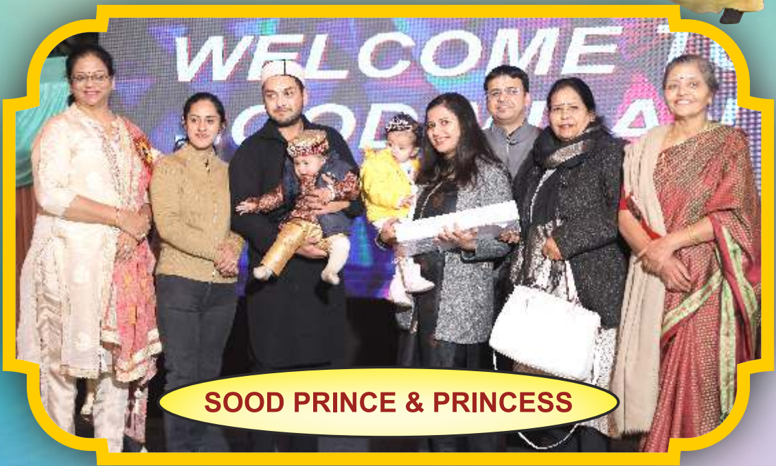
SOOD PRINCE & PRINCESS