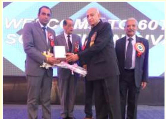
Sood Sabha Ambala