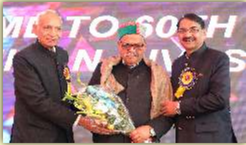
Hon'ble Mr. Justice Arun Goel (Retd.) High Court of Himachal Pradesh