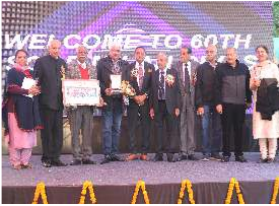
Sood Sabha Shimla