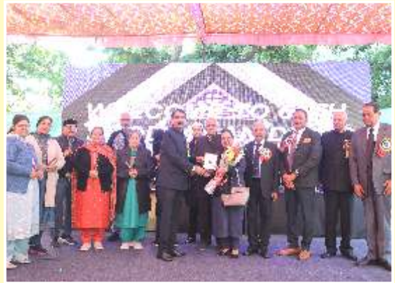
Sood Sabha Parwanoo