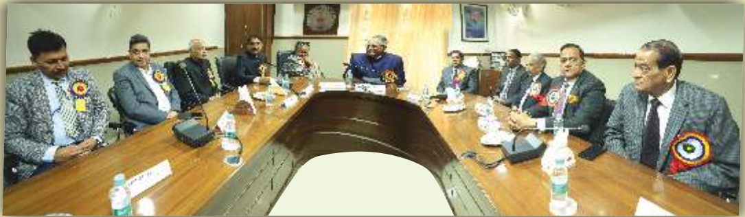
Members meeting with the Chief Guest