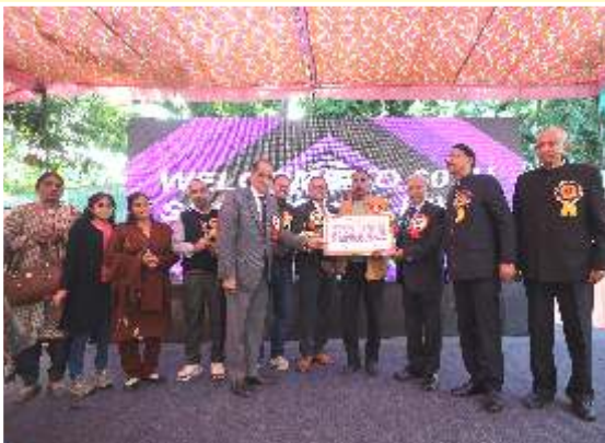
Sood Sabha Rajpura