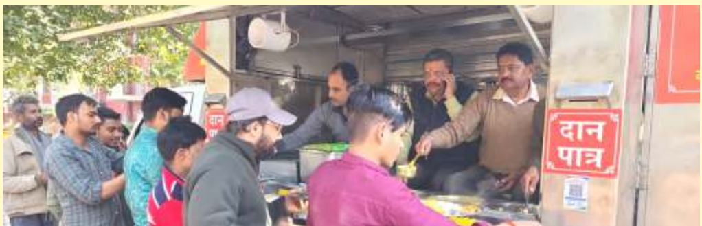
Bhandara distribution on Foundation Day