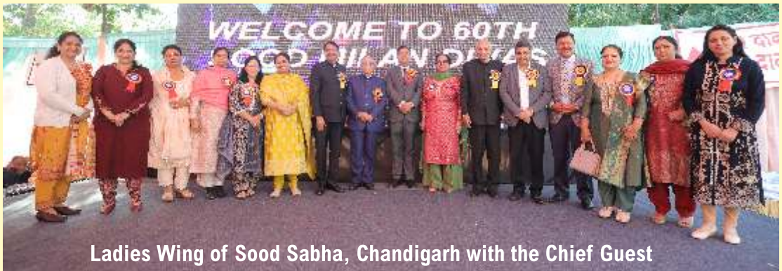
Ladies Wing of Sood Sabha, Chandigarh with the Chief Guest