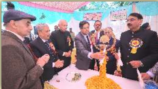
Guest of Honour Lighting the Deepshikha