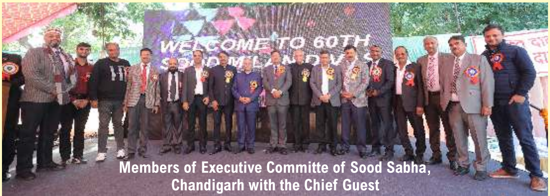
Members of Executive Committee of Sood Sabha, Chandigarh with the Chief Guest