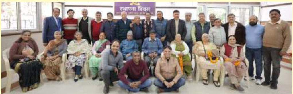
Office Bearers & Executive Members with the Families of Founder Members