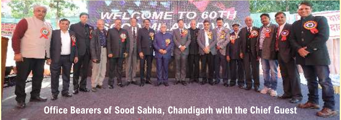
Office Bearers of Sood Sabha, Chandigarh with the Chief Guest