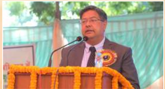
Guest of Honour