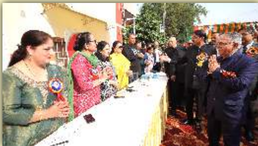
Chief Guest being greeted by Ladies Wing