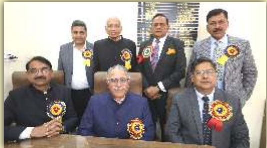
Chief Guest with Office Bearers