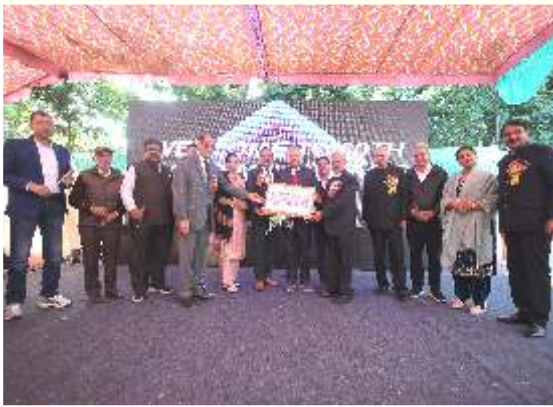
Sood Sabha Patiala