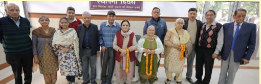
Honouring the Families of Founder Members